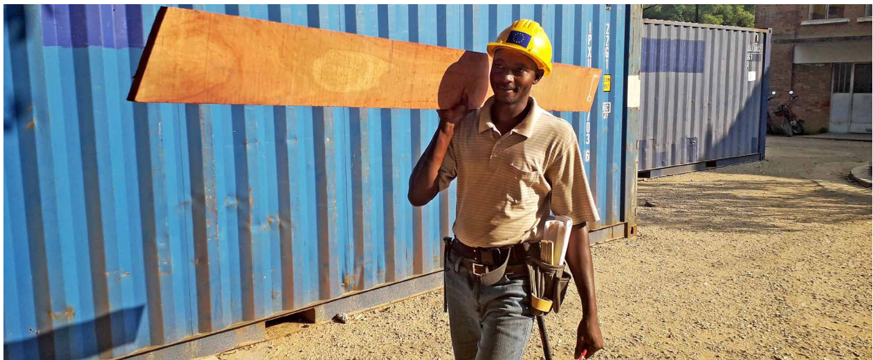
Ouvrier dans un chantier public de construction de l'Université de Kisangani, RDC