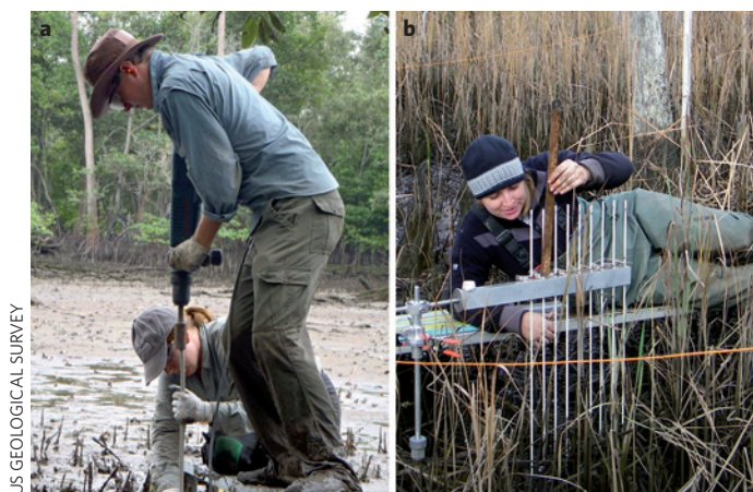
Figure 2 | RSET set-up and measurements. a , Driving an RSET rod through a mangrove soil profile. b , Measuring salt-marsh surface elevation with an RSET.

It is important to recognize the limitations of the RSET method, and the opportunities for complementarity with other technologies. First, there is a significant lag time between deployment and collection of sufficient data to make direct comparisons with local relative SLR. Trends in SLR are typically based on a minimum 30 to