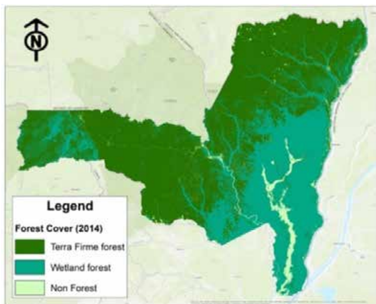
Figure 5.2: Map of the forest cover of the Sangha Likouala ERP area

The programme was finally approved in 2018 by the members of the Forest Carbon Partnership Facility (FCPF). Through it, the Republic of Congo is committed to demonstrating the feasibility of large-scale alternative development approaches to: (i) reduce greenhouse gas emissions, (ii) enhance sustainable ecosystem management, (iii) improve and diversify local livelihoods and preserve biodiversity, and (iv) diversify the national economy and increase government revenues from forests.