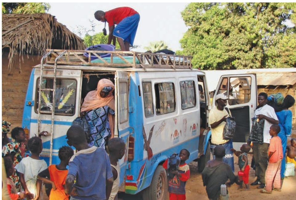
Figure III 4.1 Vehicle for villager's transportation, purchased with the profits of a forest-based enterprise.

from economic values towards emphasis on conservation and contributed to the transformation of the timber industry and its importance. Isolated forest-dependent communities show growing poverty and limited economic opportunity. Many have sought to develop business capacity to undertake restoration and manufacturing of value-added wood products, but in many communities, this has not replaced the losses brought on by the transformation of the timber industry.