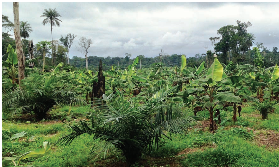
Figure III 2.1 Intercropping of bananas and oil palm by small holders.

industrial forest plantations are being established and could become dominant in the future. In South Africa [27], industrial forestry plantations are the drivers of forest industry and without them, exploitation of natural forests would be much higher and wood imports much greater.