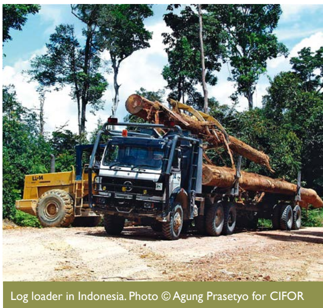
Log loader in Indonesia.

In 2003, the Indonesian government appeared, on paper, to step up its efforts by completing a draft TLAS, formally known by its Indonesian name, Sistem Verifikasi Legalitas Kayu (SVLK). However, four years later, drafting was still not complete, leading many non-governmental organizations and international agencies to question Indonesia's resolve to follow through on its commitments. Yet by late 2007, draft legislation was submitted by the Indonesian negotiators to the Ministry of Forests for approval, and, in 2009 the SVLK was signed into law. In a departure from previous efforts that were criticized as limited, independent third parties were charged with auditing compliance with Indonesian law (Luttrell et al., 2011). In addition, civil society is empowered to provide independent monitoring and to submit objections. In sum, the case of Indonesia displays a progression from no support in 1999, to weak support in 2001, to formal and legislated commitments in 2009, followed by increasing support since this time. This ongoing support was matched by increasing roles for stakeholder groups to participate in standard development processes. Civil society representatives were successful in championing good forest governance, transparency and accountability, as well as supporting third party auditing and independent monitoring.