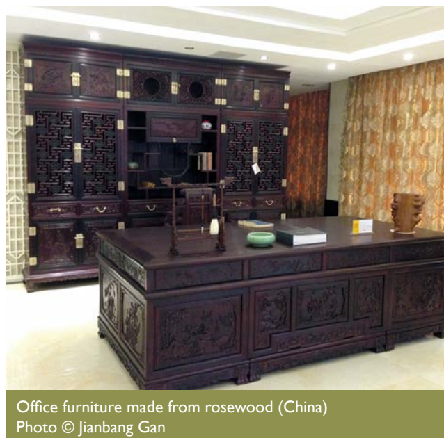
Office furniture made from rosewood (China)

Given that individual countries decided whether, and how, to implement the EUTR, it is also important to note divergent uptake/implementation within Member countries (Sotirov et al., 2015). In general, scholars have found weak implementation within poorer Eastern European countries such as Bulgaria and Romania (Gavrilit et al., 2015) as well as in Southern Europe, particularly in Greece, Italy and Spain (Sotirov et al., 2015). Other scholars have found increasing coordination between EUTR implementation and FLEGT VPA processes, owing for example to the creation of the European Commission’s EUTR/FLEGT Expert Group, an informal enforcement network convened by EU Member State Competent Authorities, and the Timber Regulation Enforcement Exchange (TREE) network organized by Forest Trends, which brings together environmental