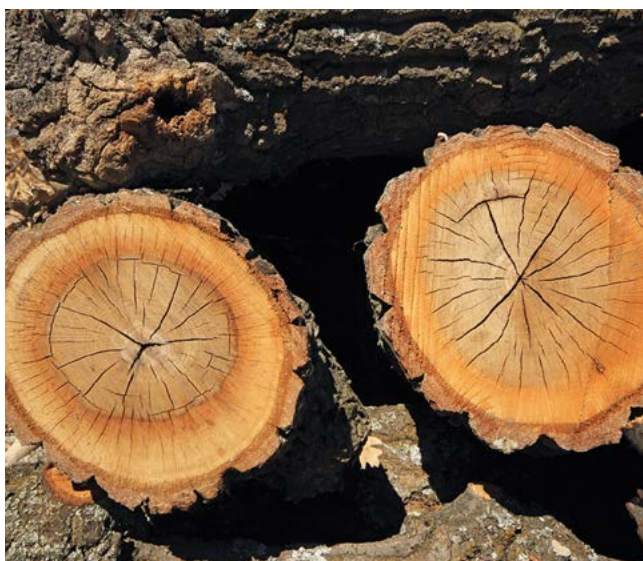
Mahogany wood. Trading mahogany species is restricted by the Convention on International Trade in Endangered Species of Wild Flora and Fauna (CITES).

We proceed in the following steps. Following this introduction, step two reviews how the problem of “illegal logging” emerged on the international agenda. Step three reviews leading policy interventions that resulted from this policy framing. Step four reviews developments in selected countries/regions around the world according to their place on the global forest products supply chain: consumers (United States, Europe and Australia); middle of supply chain manufacturers (China and South Korea) and producers (Russia; Indonesia; Brazil and Peru; Ghana, Cameroon and the Republic of Congo). We conclude by reflecting on key trends that emerge from this review relevant for understanding the conditions through which legality might make a difference in addressing critical challenges.