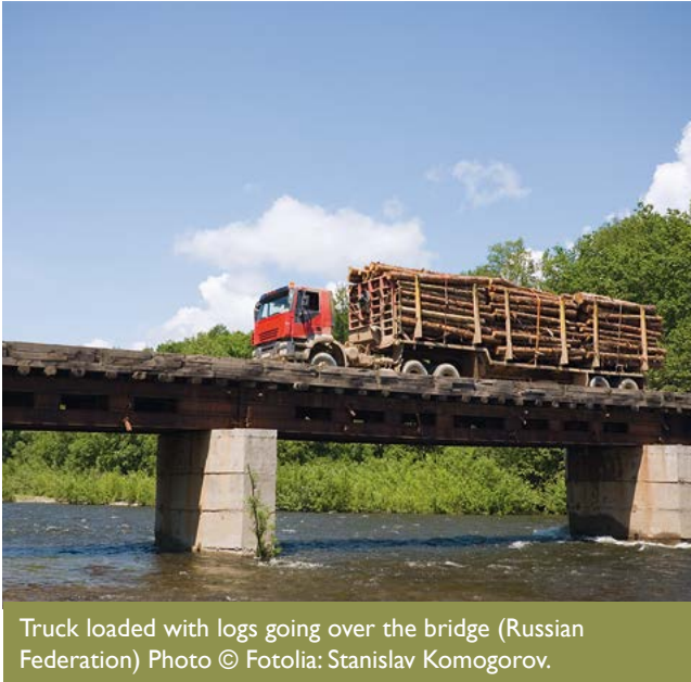
Truck loaded with logs going over the bridge (Russian Federation)

five-fold increase in losses from the forest sector over 10 years culminating to more than half a billion USD in 2014 (Federal State Statistics Service, 2015).