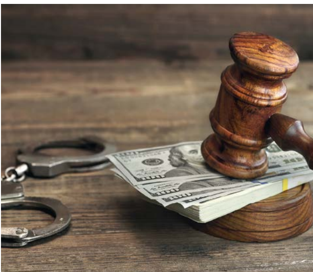
Dollar banknotes, handcuffs and judge gavel

Public policies and public-private initiatives can reduce some of the opportunity structures that currently still exist in favour of illegal timber trade. For example, preventive anti-corruption policies can be developed for certain vulnerable and criminogenic professions and