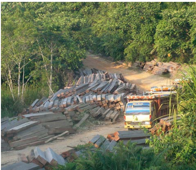
Large-scale timber trafficking from Indonesia to Malaysia in the interior of Borneo. Meranti timber that was illegally logged in Indonesia's Betung Kerihun National Park is waiting to be trafficked to nearby Malaysia (Sarawak).