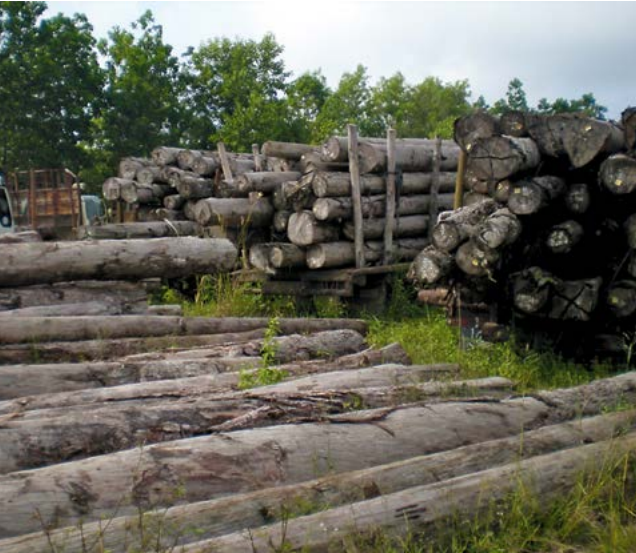
These illegal logs were seized, while in transit, and impounded at district police offices, Riau, Sumatra, Indonesia.