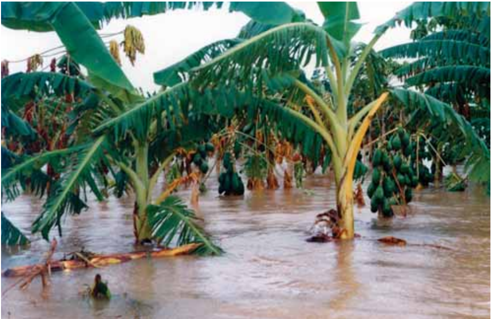
Flooding in Tonle Sap area of Cambodia inundates agricultural lands

Effective watershed and forest management consistently yield significant environmental services, including high-quality fresh-water supplies. However, the influence of watershed and forest management practices on stream-flow patterns is relatively small, and is mainly limited to watersheds up to 500 km 2 in area. As such, forests alone will not be able to protect entire river basins from catastrophic events. Even with the best intentions, no amount of watershed management interventions will prevent major flooding events, although there are some definite benefits at the local scale.