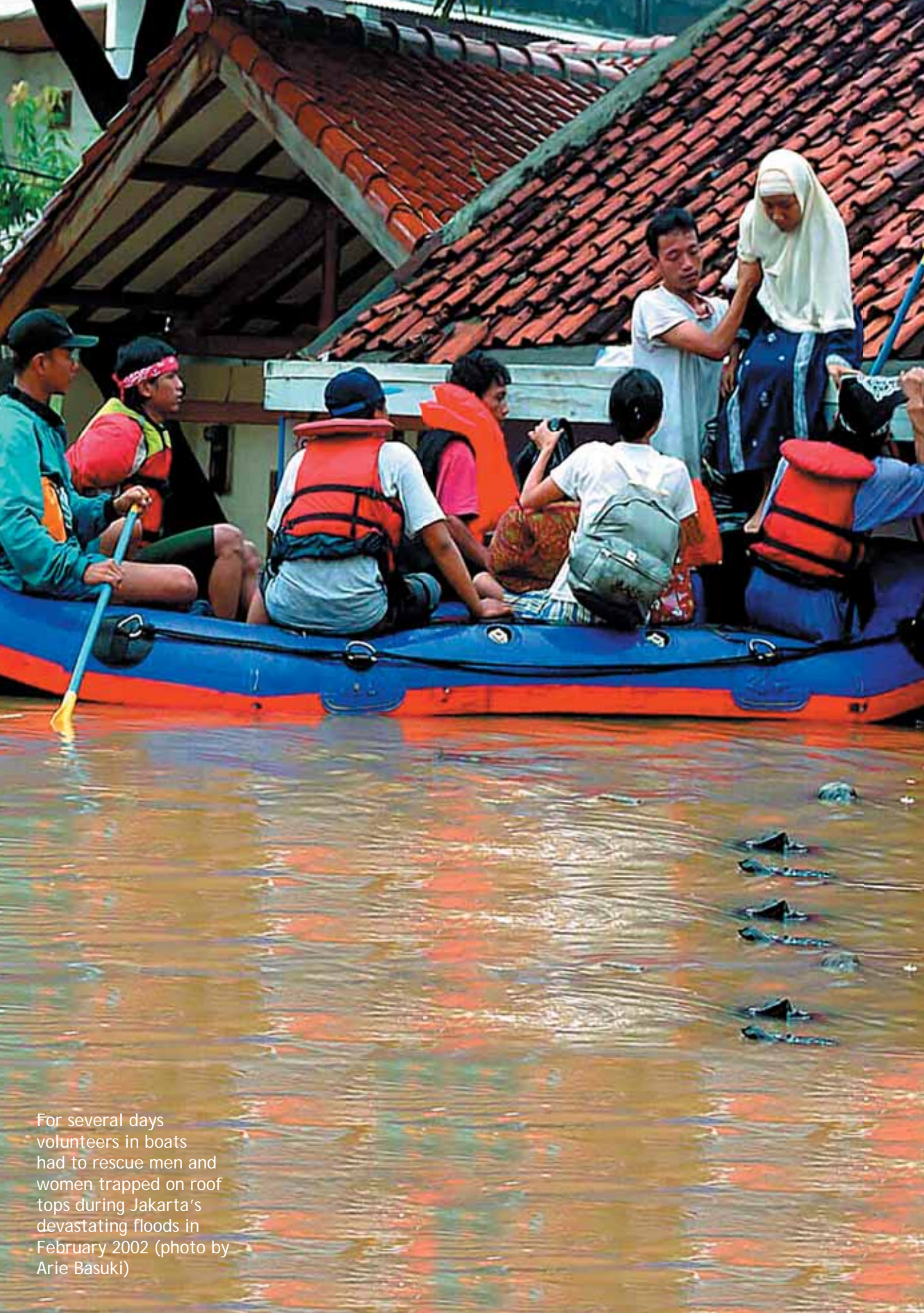
For several days volunteers in boats had to rescue men and women trapped on roof tops during Jakarta's devastating floods in February 2002