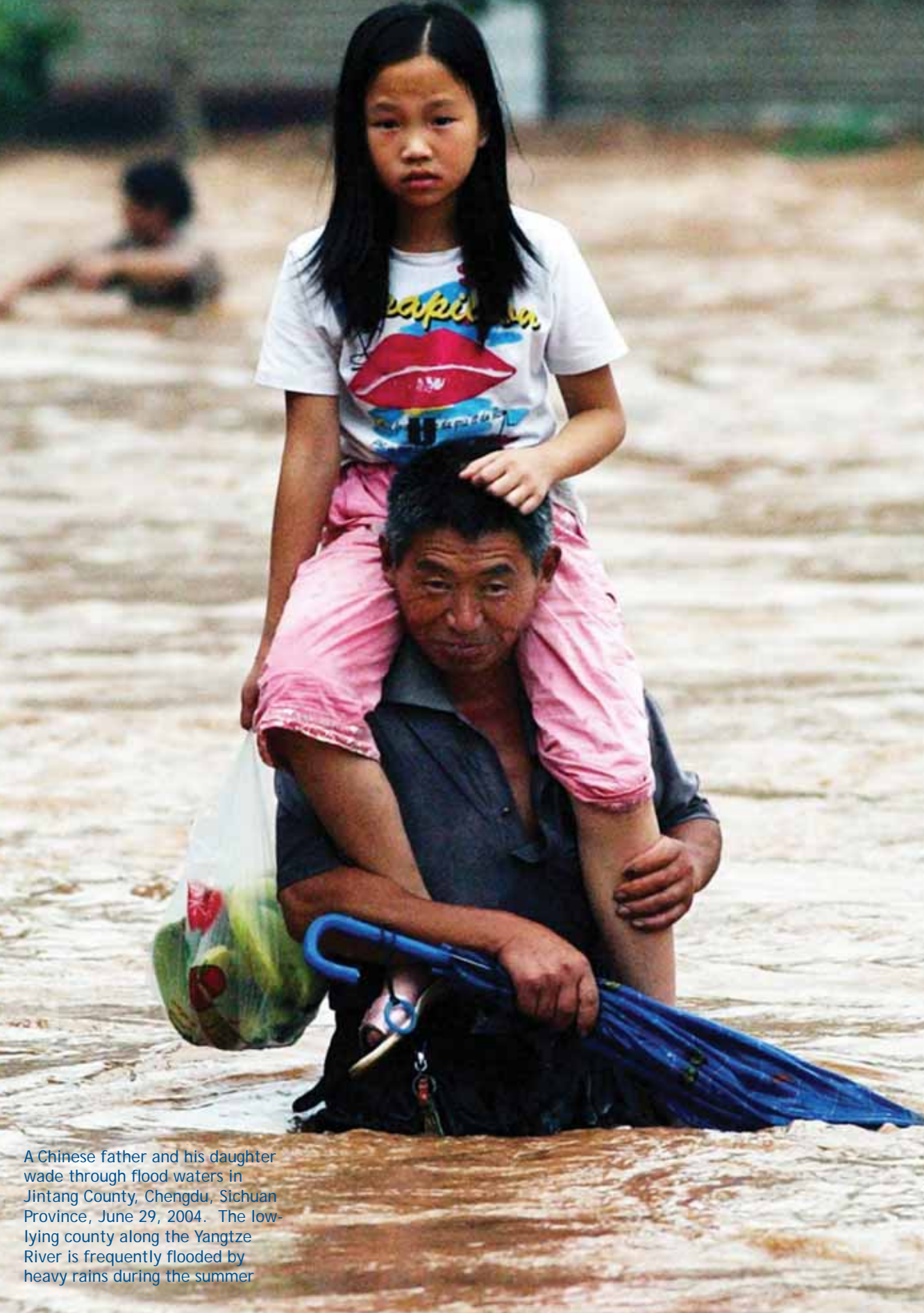
A Chinese father and his daughter waded through flood waters in Jintang County, Chengdu, Sichuan Province, June 29, 2004. The low-lying county along the Yangtze River is frequently flooded by heavy rains during the summer