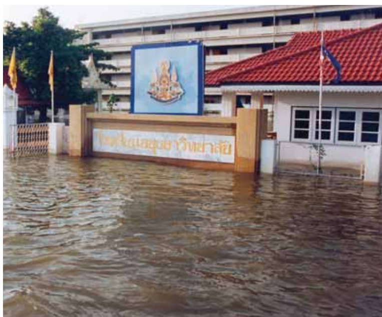
Urban flood in Bangkok, Thailand