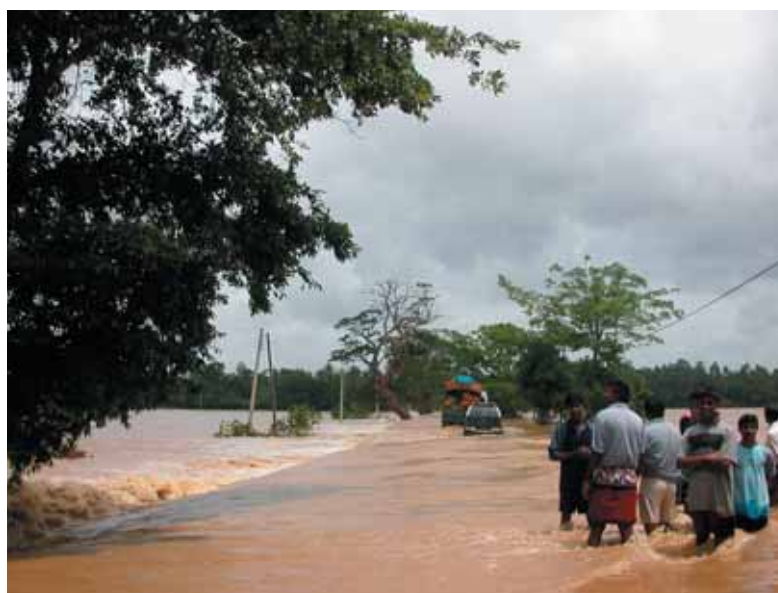
Floods after heavy rain in May 2003, Ranna, Hambantota District, Sri Lanka

Incentives need to be offered to encourage desired land uses and land-management practices and to align private interests with the public good. Compensation needs to be provided to land users negatively affected by the plans. The results of the implementation are monitored and impacts of various policy instruments and interventions assessed, to ensure that the objectives are being achieved and that costs and benefits are equitably shared. The entire process is evaluated on a regular basis and, if necessary, objectives or activities can be adjusted to meet new requirements or expectations. Management objectives can change over time as priorities and land-use practices evolve. This is a dynamic process that ensures, through the various feedback mechanisms, that objectives remain realistic and can be reached without causing unacceptable and unmanageable environmental and socio-economic impacts.