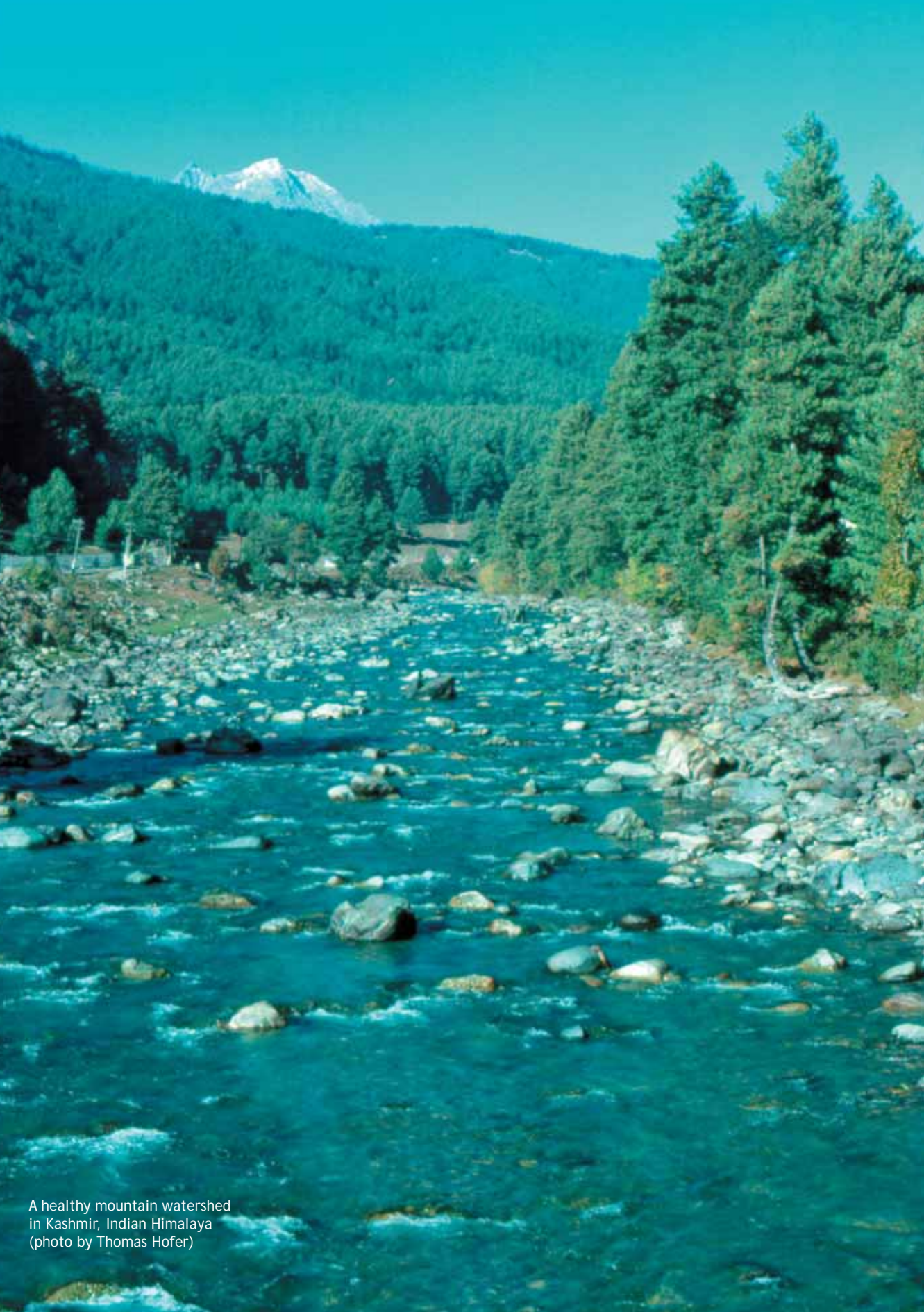
A healthy mountain watershed in Kashmir, Indian Himalaya