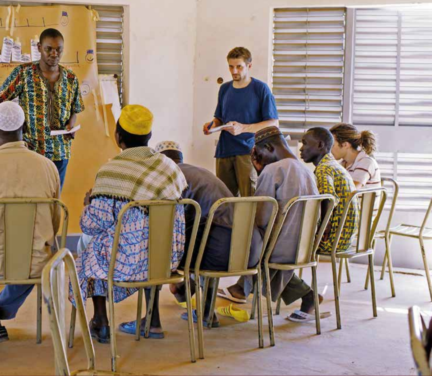
▲ Gathering local knowledge on climate change, Burkina Faso

We have initiated both strategies and research for more effective capacity building. ICRAF developed a new capacity building strategy, and a CRP-FTA-wide project, entitled 'Toward more effective capacity building: A comparative evaluation of CRP-FTA partner center experiences', will be implemented in 2013. Similarly, the CRP-FTA gender fellowship scheme will be initiated in 2013 as a result of collaboration among CRP-FTA gender focal points in 2012.