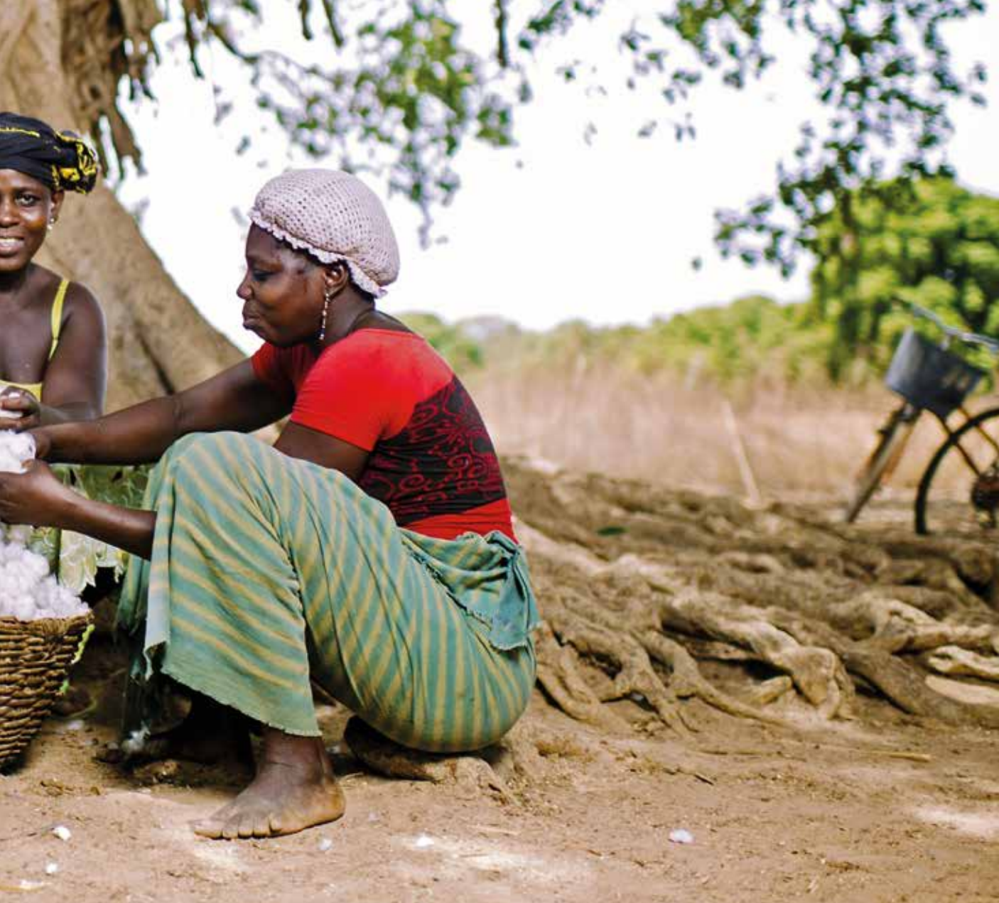
▲ Cotton ginning, Burkina Faso