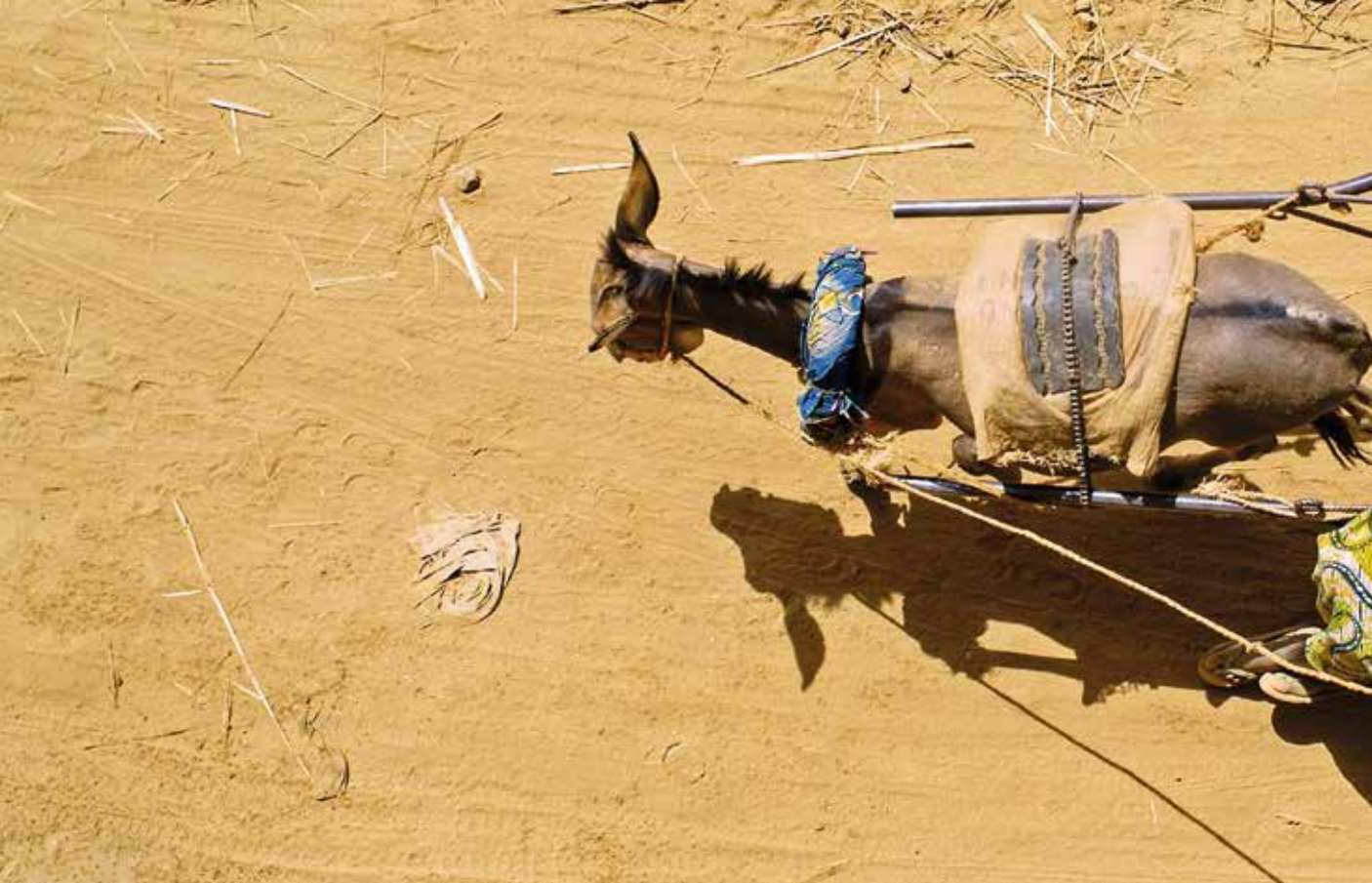
▲ Water porter for gold panning, Burkina Faso