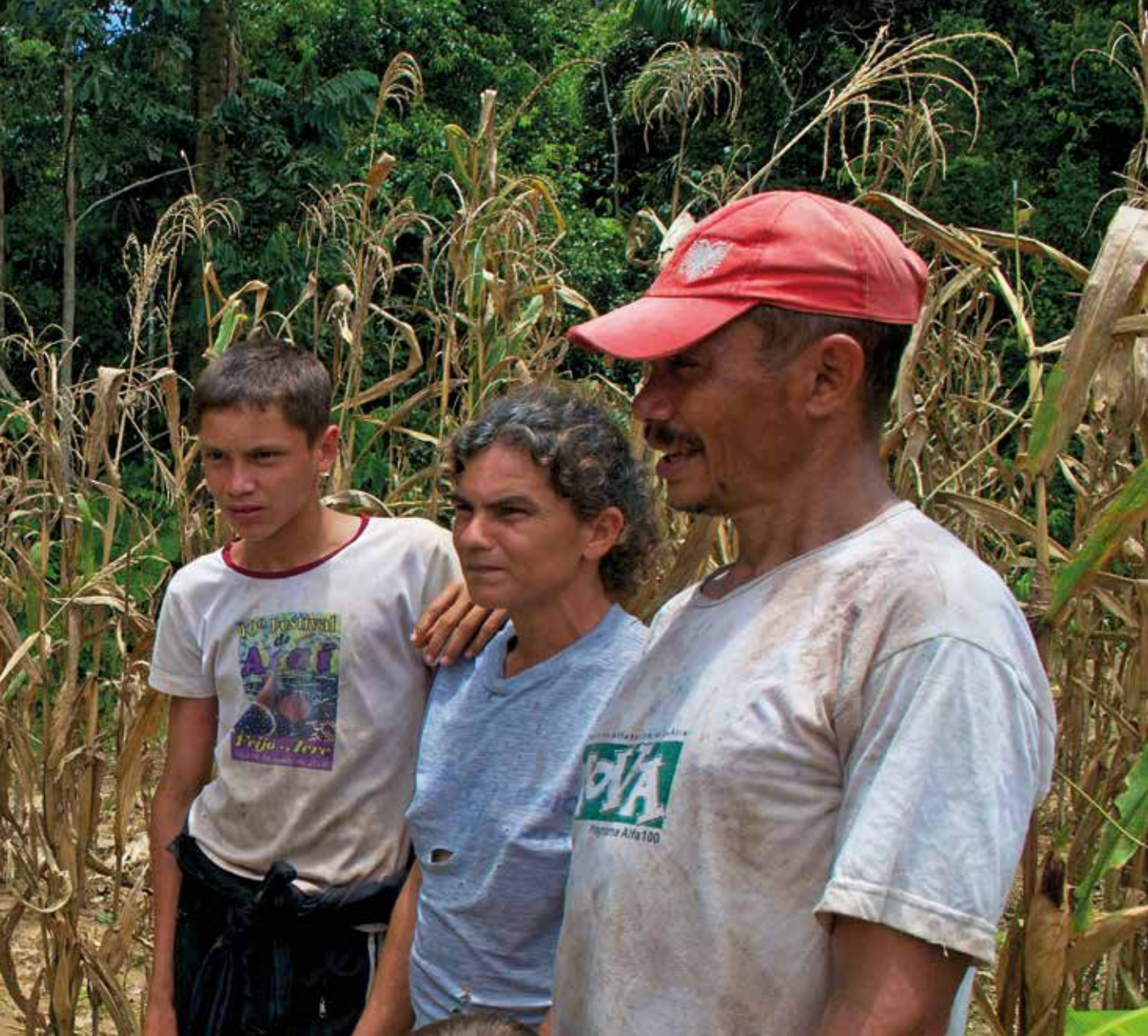
▲ CIFOR scientists talking with local community members