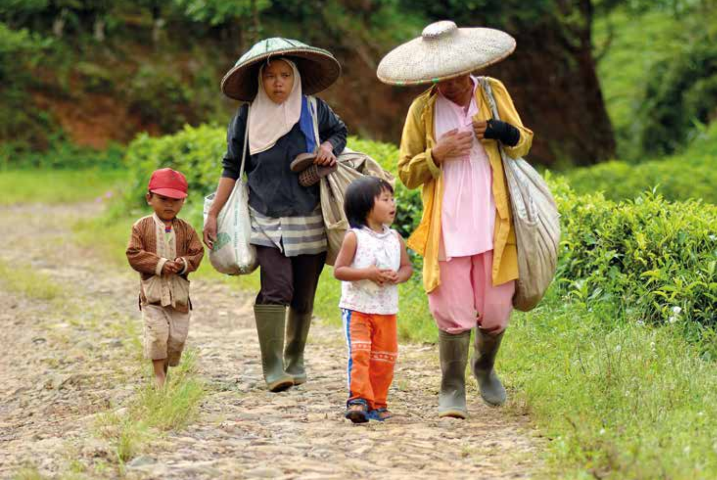
▲ Tea plantation workers, Halimun Salak National Park, West Java

Our research complements CRP-CCAFS. We will use data sets from our respective work on oil palm in Sumatra, for example to produce a series of joint papers.