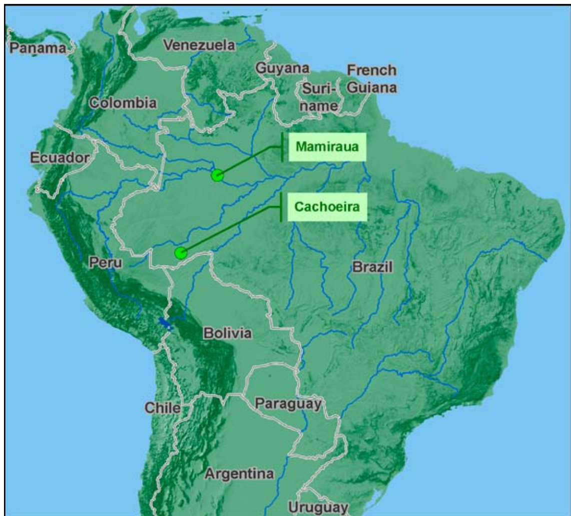
Figure 3: Acre and Mamirauá, Brazil

defending their livelihoods could successfully form alliances with key international actors and influence policy at the regional scale.