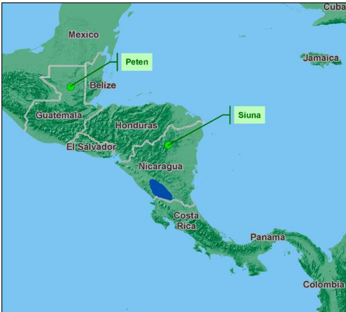
Figure 1. The Petén and Siuna, Central America

opportunities for sustainable use of natural and cultural resources (Gómez and Méndez 2005; CONAP 1996; UNESCO 1996). Although ACOFOP is a successful manifestation of this type of integrated approach to conservation and development, it continues to struggle to maintain its position and control over tropical forests held in concession.