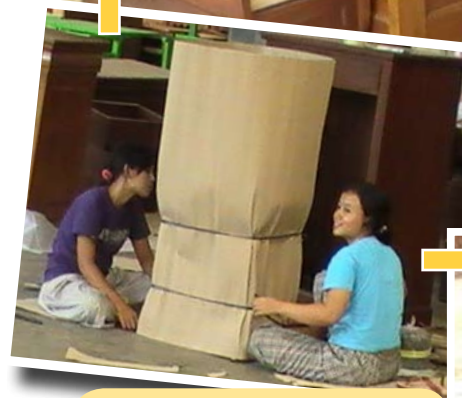
Smoothly finished, end products get packed for shipping – mostly by female laborers.