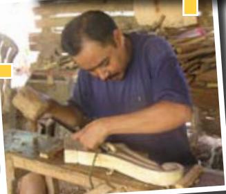
The furniture value chain: From trees to log yards, to sawmills and producers.