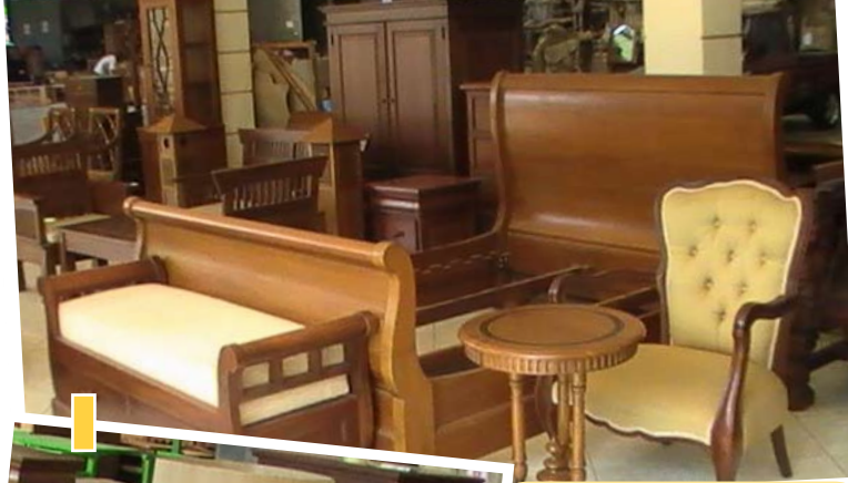
Furniture products end up in domestic showrooms or shipped for export.

Jepara is located in Central Java, Indonesia, a key location for job creation and wood consumption. Furniture making is the backbone of the local economy and culture.